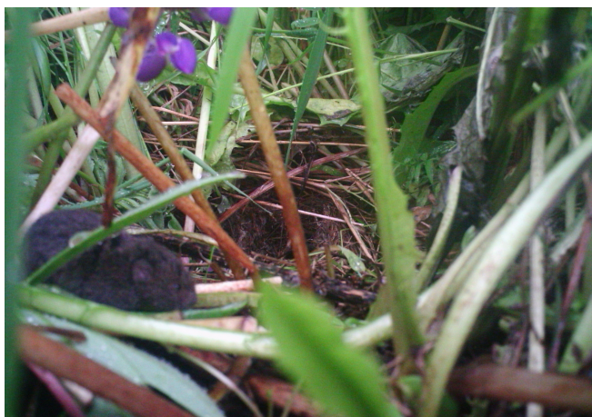
Fig. 3. Depredation Booted Warbler's nest by small mammal.