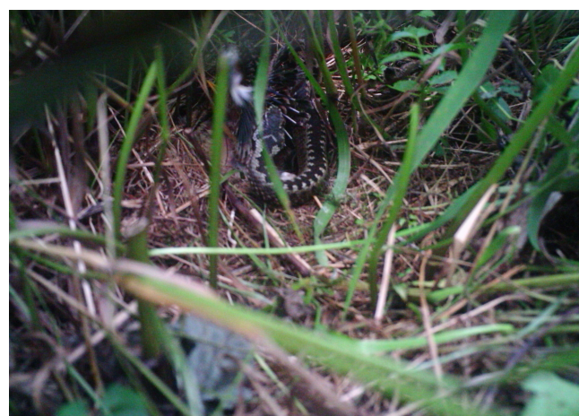
Fig. 2. Depredation Whinchat's nest by Common Adder Vipera berus .