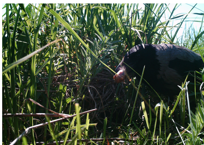
Fig. 1. Depredation Whinchat's nest by Hooded Crow Corvus cornix .