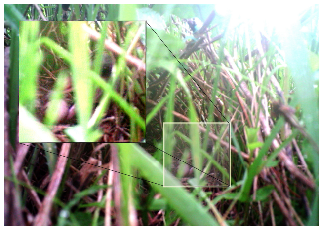
Fig. 4. Depredation Booted Warbler's nest by Corncrake Crex crex .

The most identified predators are typical destroyers of open-nesting passerine birds in farmland areas across Europe (Angelstam, 1986; Andren, 1992; Söderström et al., 1998; Evans, 2004), except the Common Adder and Corncrake. The Common Adder is a common predator of passerine nests in the north of European Russia where passerine nestlings form 6% to 100% of the Adder's diet (Belova, 1978; Korosov, 2010).