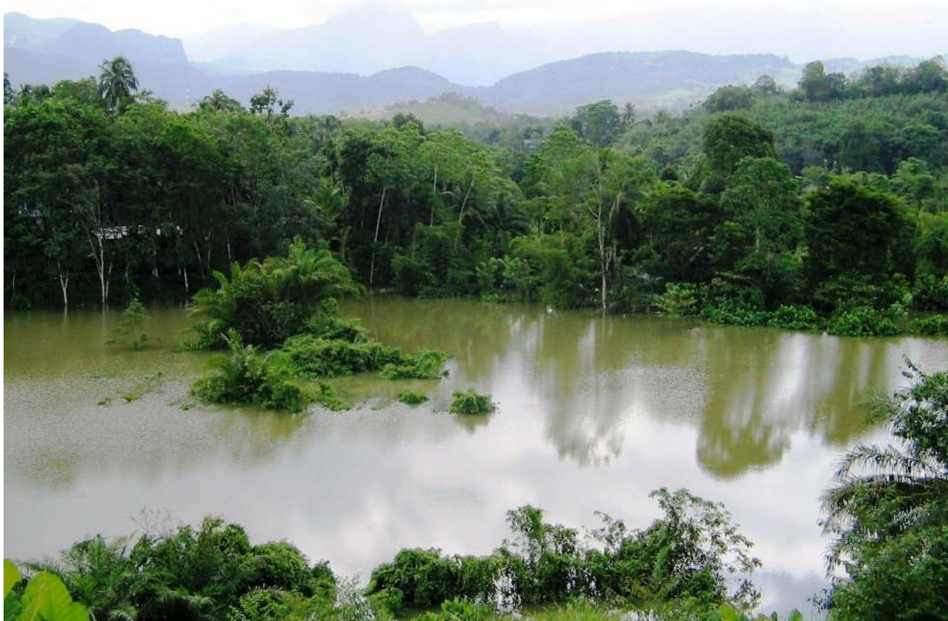
Fig. 10. Flood in lowlands.