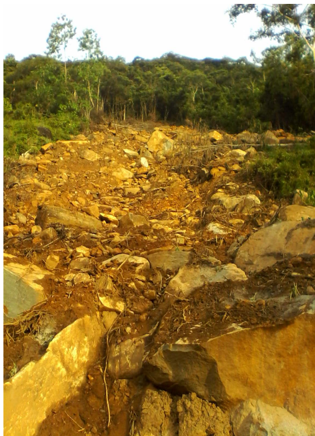
Fig. 9. Landslide due to heavy rainfall.

biodiversity in Sri Lanka. Further, the agriculture sector covering a large proportion of lands in all climatic regions and terrains from the coastal belt to the mountainous regions immensely contribute to biodiversity in Sri Lanka. For instance, the plantation sector (tea, rubber & coconut, etc.) covers over 8000 km 2 , which provides a habitat for a large part of the flora and fauna in Sri Lanka (MOE, 2010). Although the impacts on crop yields have been investigated, that on biodiversity in the agriculture sector have not been fully understood yet. Due to pressure from the ever rising population and expansion of industries etc., the demand for land has been tremendously increased. Often, agricultural lands are used for such purposes, impacting biodiversity. However, information and precise data on the impacts of such land use changes on biodiversity is lacking. Being a developing country with many economic challenges, the funds and expertise available for monitoring climate change impacts and biodiversity conservation are not sufficient either. A large variation in climatic conditions and land terrains on the island is a challenge for the limited number of scientists and conservators.