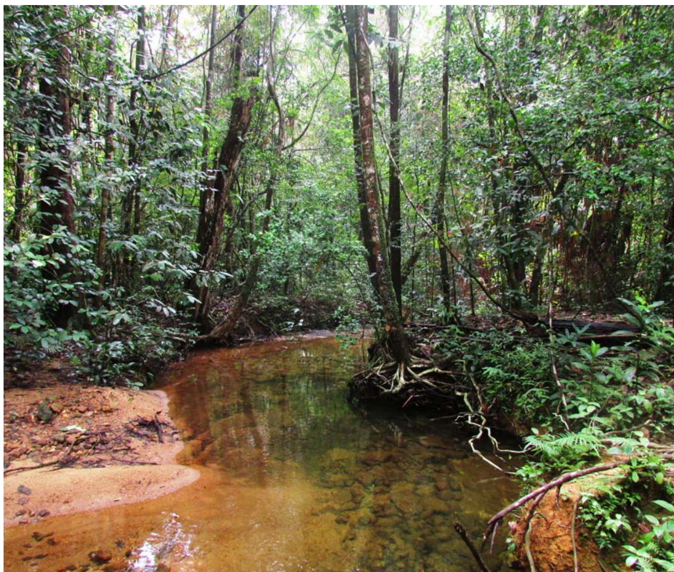
Fig. 2. Lowland rain forest.

the country assuring a sustainable supply of food. Agricultural plant diversity on the island includes Oryza sativa L. (rice / paddy) with improved varieties/land races (Fig. 3), cultivars of maize and sorghum; grain legume species; root and tuber crop species and other vegetables (Gunatilleke et al., 2008). Major plantation crops, covering a large extent in Sri Lanka are tea, rubber, coconut and sugarcane. Cinnamon, pepper, cardamom, coffee, cocoa and arecanut plantations are considered as minor-export crop species. Mixed cropping systems with different perennial crops listed above, having varying heights of canopies and flowering patterns, can be considered as sustainable agro-forestry systems, enriched with biodiversity. A large number of endemic and introduced fruit crop species grown in different climatic regions also helps enhancing the biodiversity in Sri Lanka.