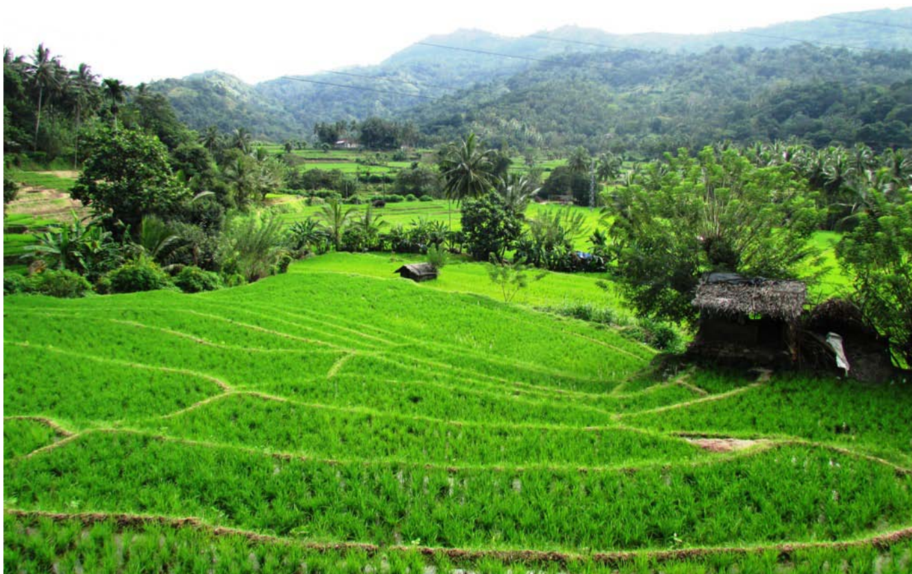
Fig. 3. Traditional agriculture system (rice / paddy field).

Several studies have determined the effects of a human-dominated landscape such as agroforestry and forestry's plantation system on fauna, highlighting the importance of habitat characteristics in sustaining high diversity (Ficetola & Bernardi, 2004). Agroforestry systems such as plantations of coffee (Greenberg et al., 1997), cacao (Wanger et al., 2009), rubber (Aratrakorn et al., 2005) and oil palm (Gallmetzer & Schulze, 2015) support a greater number of selected faunal groups with a higher diversity, compared to open agricultural systems in the tropical region. In Sri Lanka, limited biodiversity studies have been conducted with selected taxa in monoculture plantations (Kottawa-Arachchi et al., 2015b).