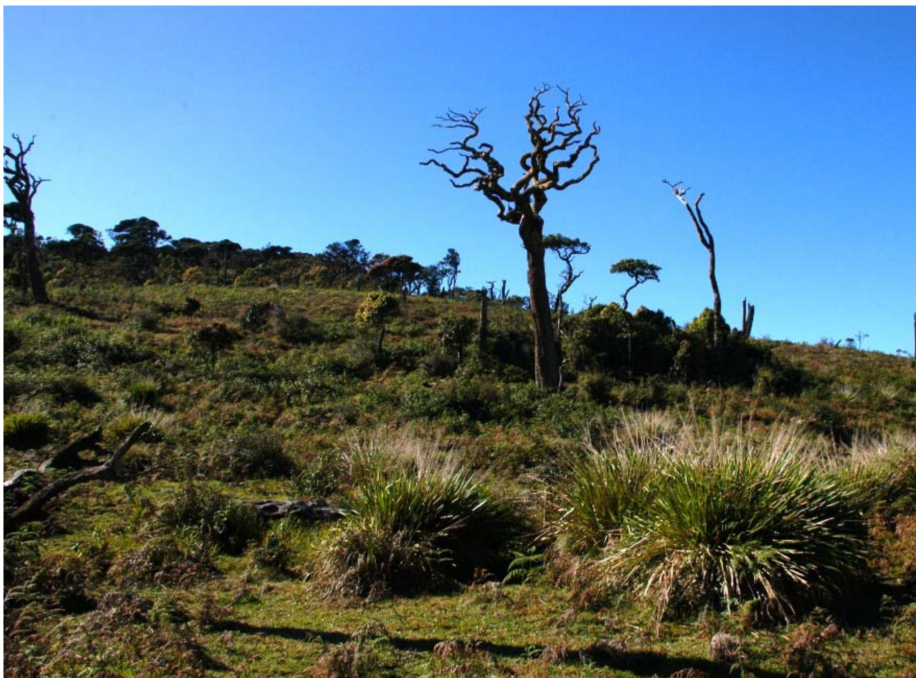
Fig. 6. Dying back of tropical upper montane forests.

Most of the invertebrate pollinators comprise bees, wasps, ants, beetles, butterflies, moths and flies. Some vertebrates such as bats and birds also contribute to the pollination (Punchihewa, 2013). Bees (Insecta: Hymenoptera) are the most important pollinators of flowering plants including agricultural crops, resulting in fruit and seed production. Communities of wasps and bees play a key role in ecosystem functioning and they have been used in studies of biodiversity assessment in different land-use types (Matos et al., 2013). The density and distribution of bees depend largely on climate, altitude and presence of suitable flowering plant species. A study conducted in Knuckles mountain range highlights the fact that the highest diversity of bees was at lower elevations where the climate was comparatively warmer (Karunaratne & Edirisinghe, 2008). Therefore, the diversity of bees at different altitudes may provide clues to the likely responses of bee species and communities to climate change at any one point over time. Nevertheless, lower