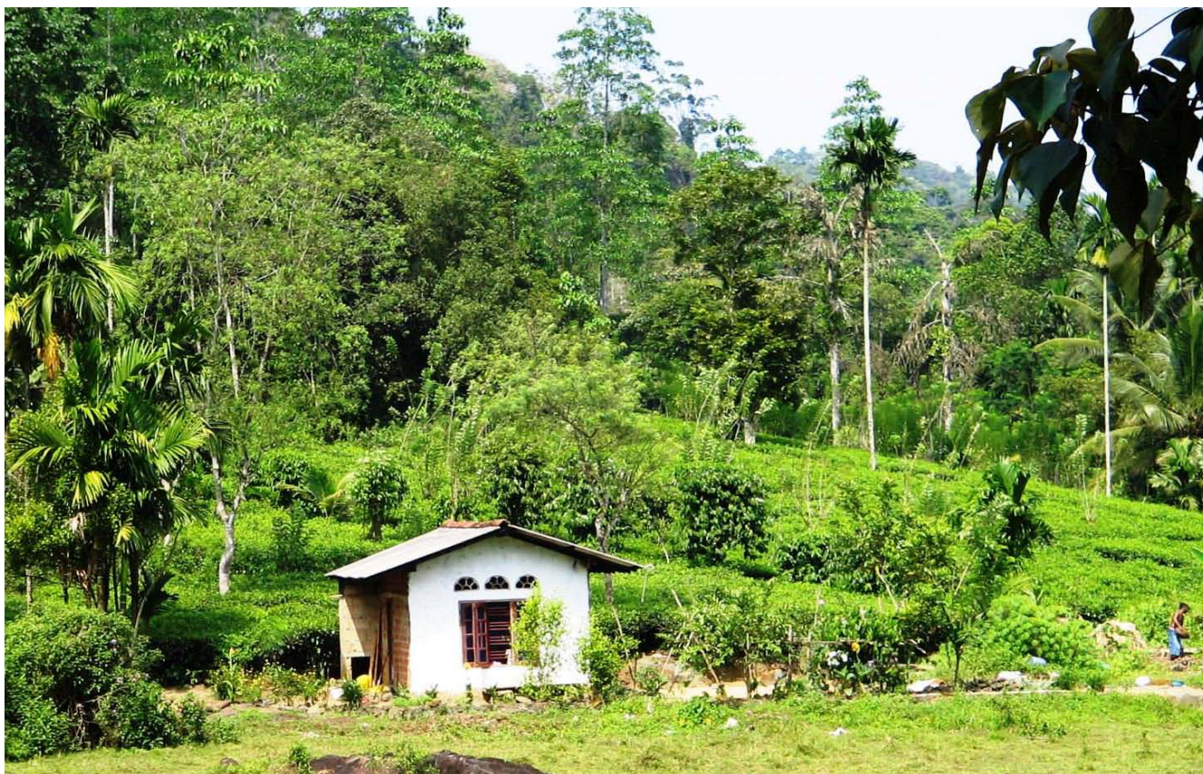
Fig. 4. Homegarden with tea ( Camellia sinensis (L.) Kuntze) ecosystem.