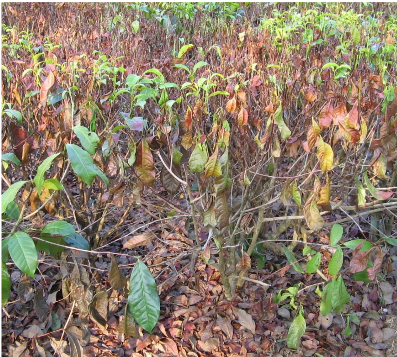
Fig. 8. Drought affected tea bushes at low elevation.