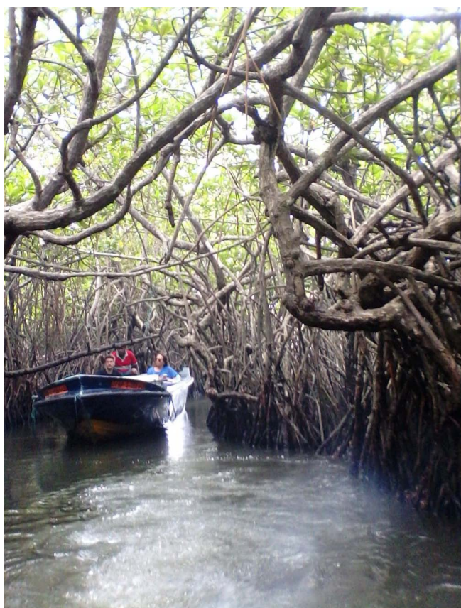
Fig. 7. Mangrove ecosystem.