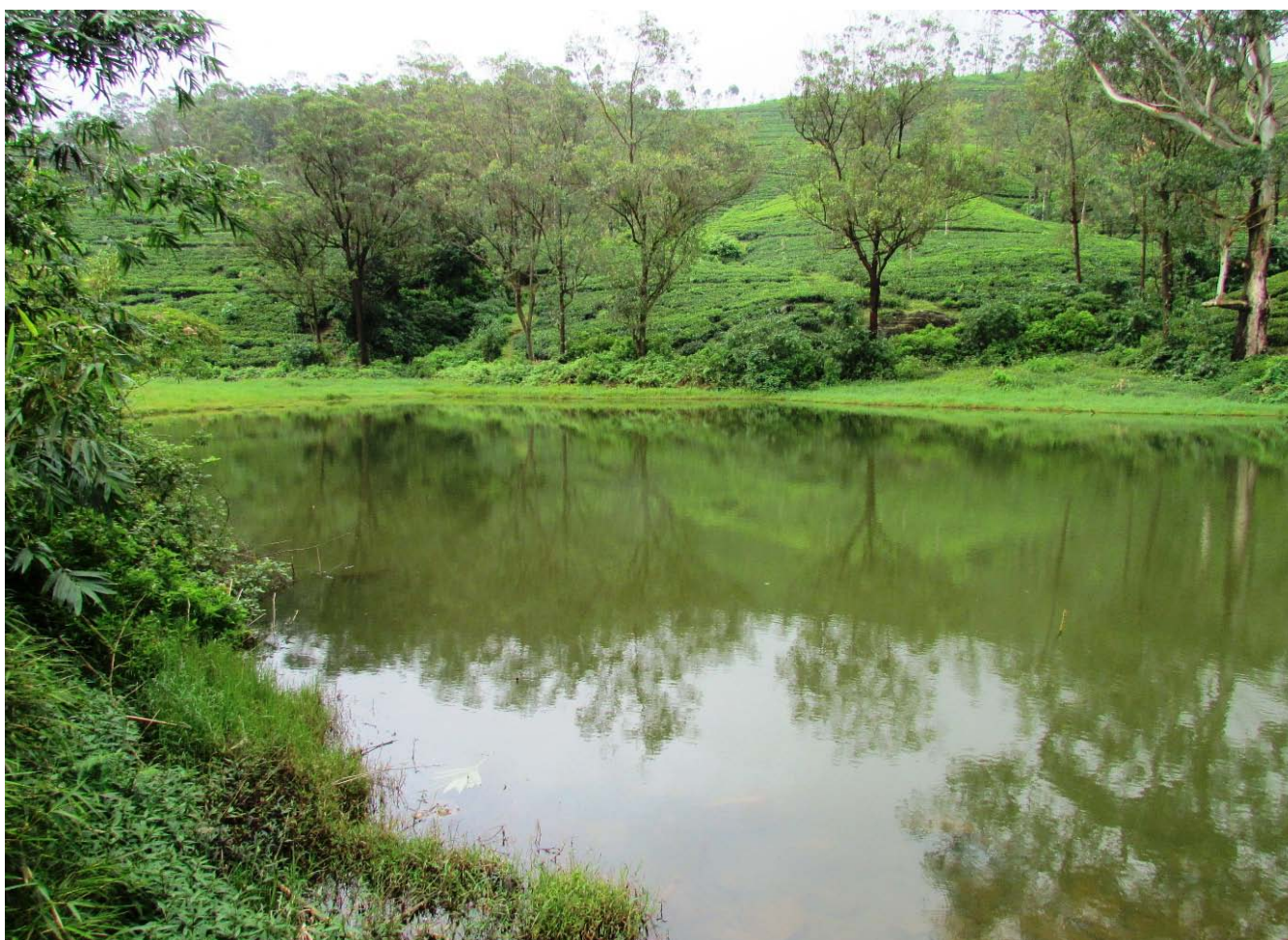
Fig. 5. Freshwater marsh in a tea plantation.