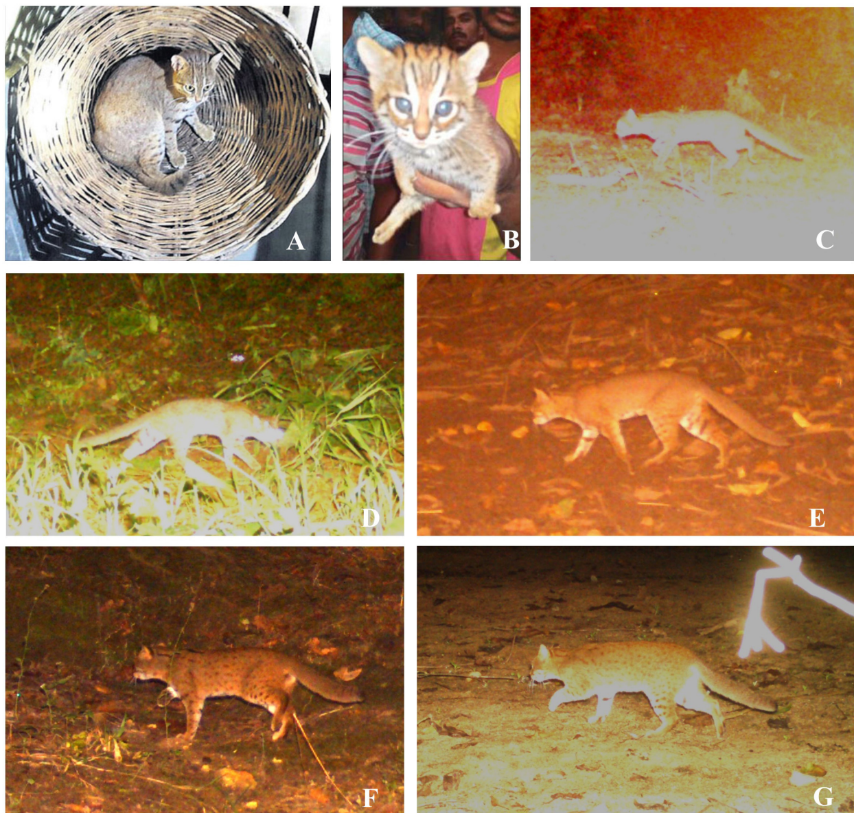
Fig. 2. Occurrence records of the Rusty-spotted Cat Prionailurus rubiginosus in Odisha, eastern India. A. Rescued in Ghumusur North Forest Division; B. Rescued in Phulbani Forest Division; C. Camera trapped in Debrigarh Wildlife Sanctuary; D. Camera trapped in Bargarh Forest Division; E. Camera trapped in Sundargarh Forest Division; F. Camera trapped in Sundargarh Forest Division; G. Camera trapped in Bolangir Forest Division (see details in Table 2).