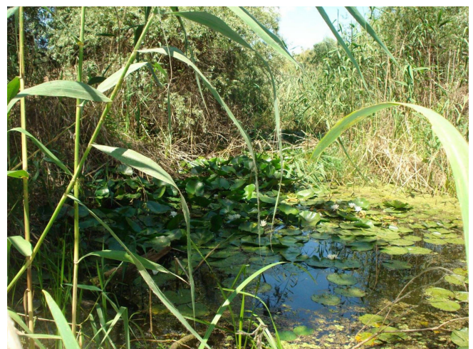
Fig. 3. Habitat of the Dolichopus species. Astrakhan State Nature Biosphere Reserve, Damchiksky branch, Bystraya channel.