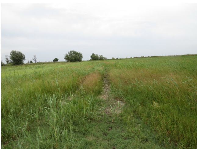
Fig. 2. Habitat of Asyndetus albipalpus and Asyndetus chae-tifemoratus , Astrakhan State Nature Biosphere Reserve, Trekhizbinsky branch, Trekhizbinka.