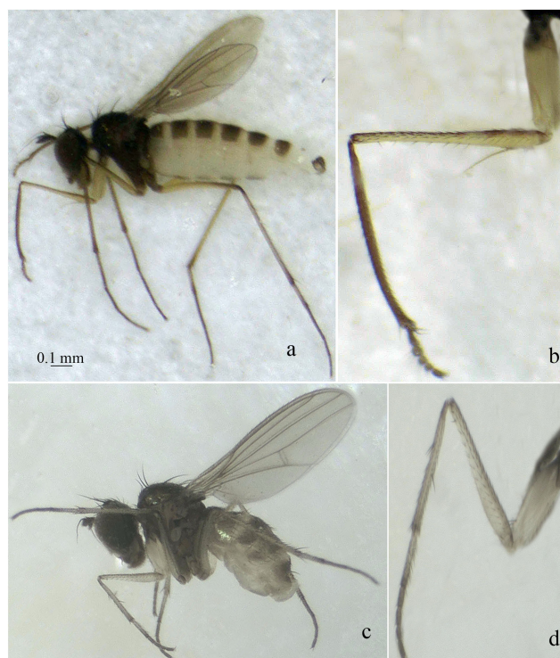
Fig. 4. Campsicnemus filipes : a – habitus, male, lateral view; b – male, fore legs; c – habitus, female; d – female, fore legs.

Material. 8 ♂, 8 ♀, Damchiksky branch, Damchik settlement, 25–30.06.2014, shore of the channel Srednyaya Bystraya, 02–03.07.2014, Obzhorovsky branch, shore of the channel Poldnevoe, 10–15.07.2014 (Lopyreva, Anokhin). The species is described from Tajikistan. Currently, it is also known from Turkey. This is the first record for Europe and Russia.